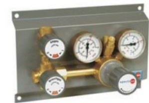
CRS2000V-1 single-sided model