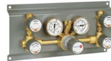
CRS2000V-2 manual change-over model