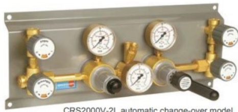
CRS2000V-2L automatic change-over model